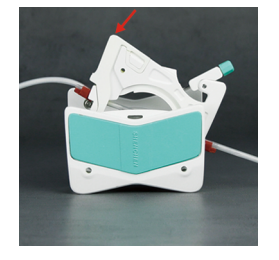
3. Press the cartridge to make the cartridge enter the working position.