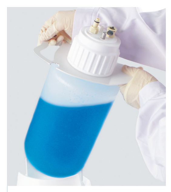
Stand for transferring the bottle securely and holding the hand operator