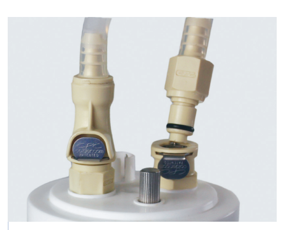
Self-closing connectors to avoid escape of drops or aerosols from disconnected bottle