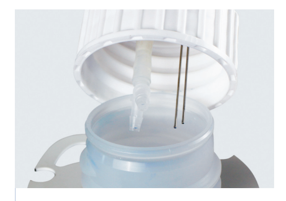
Sensitive level sensor to prevent liquid overflow